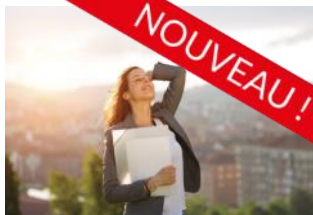
Wellbeing at work