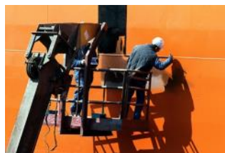
Construction site safety / Work at height