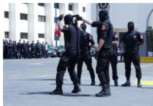
Urban Security / Crisis magement