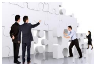
Council, Training, Insurance and Certification