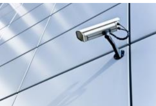
CCTV / Videoprotection